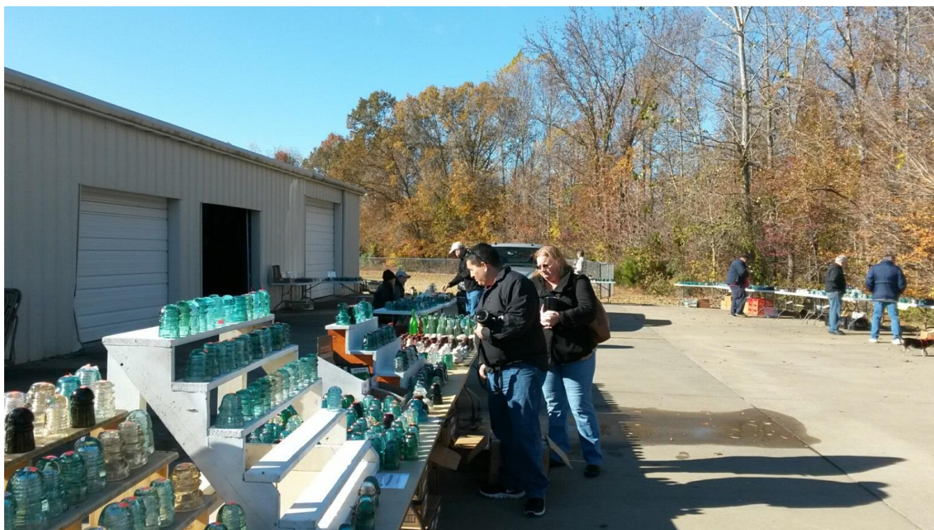
Here is the other side of the parking lot. There were also at least 8 tables of insulators set up inside the building.