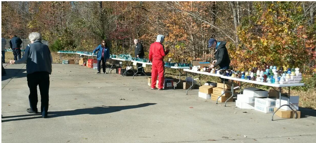
There were plenty of insulators at the swap meet. This shows one side of the parking lot before everyone got set up.